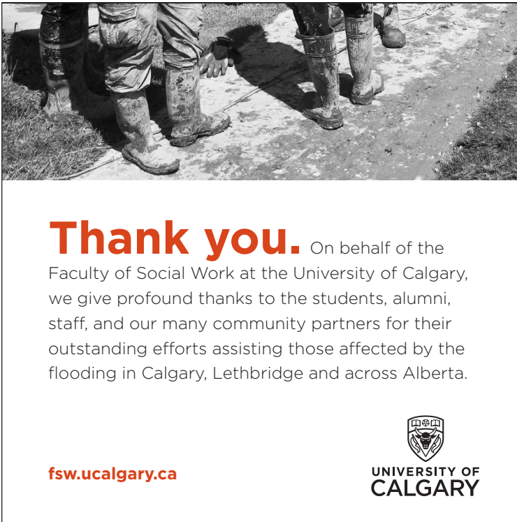
Example: Thank you ad