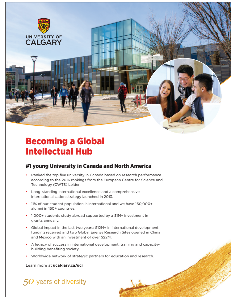
Example: Institutional ad