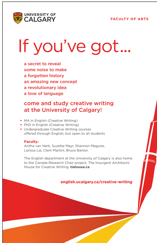
Example: Faculty of Arts promotional ad